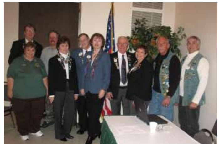
Governor Night – Cedar/East Bethel and Ham Lake Lion and Lioness Presidents and Secretaries