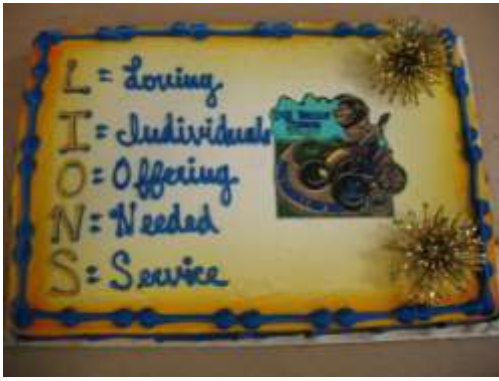
Decorated cake for Coon Rapids Governors Night