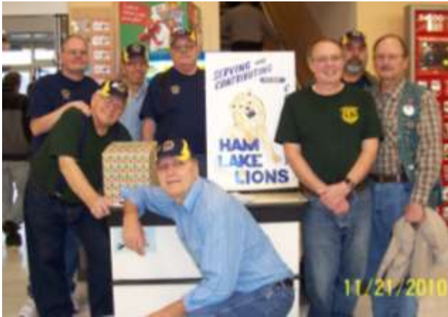
Ham Lake Lion's bagging at Blaine cub for food shelf donations.