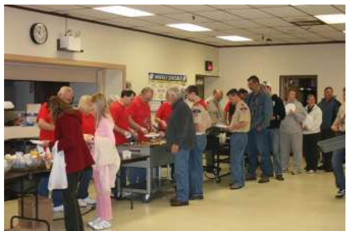
Coon Rapids Pancake Breakfast with very long lines, Yum Yum!!