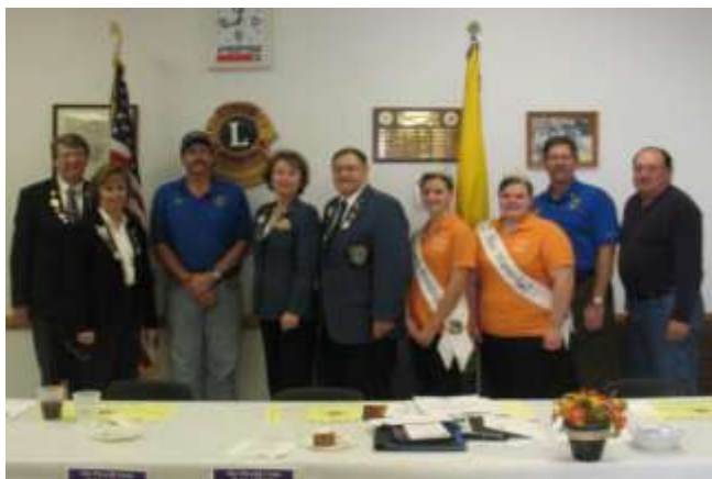
Waverly Governors Night – including Waverly Royalty who served the meal