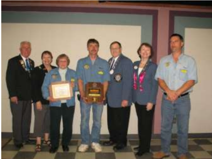
Clearwater Governor's Night