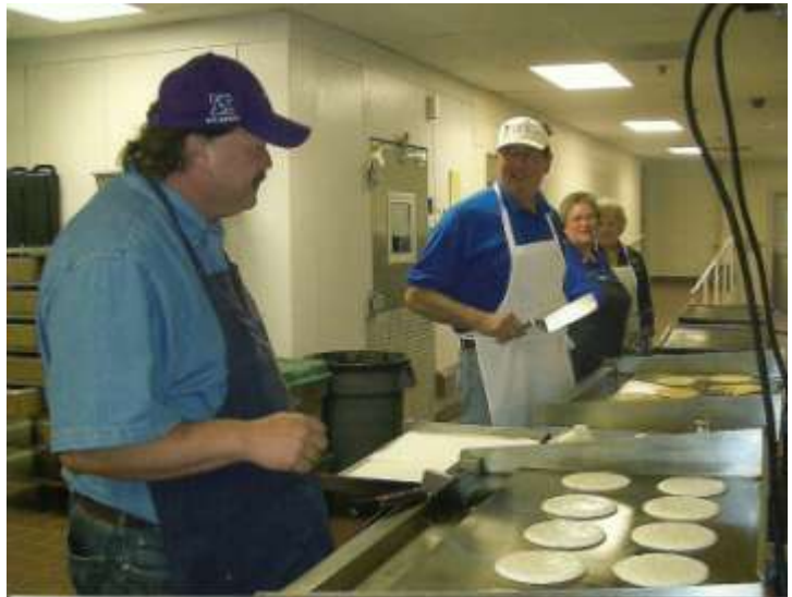
Spring Lake Park Lions cooking pancakes and French toast.