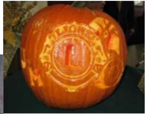
Pumpkin carved for the "Thanksgiving for Vision"