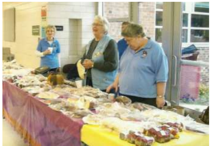
Spring Lake Park Lioness Bake Sale