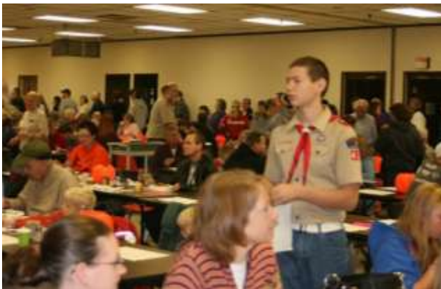
Coon Rapids Lions serve many at Fall Pancake/French Toast Breakfast