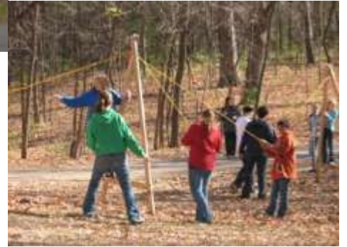
Leos' Forum Camp Friendship -team-building experience