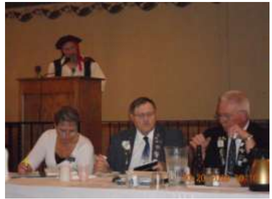
Is that really a pirate at the Cabinet meeting?