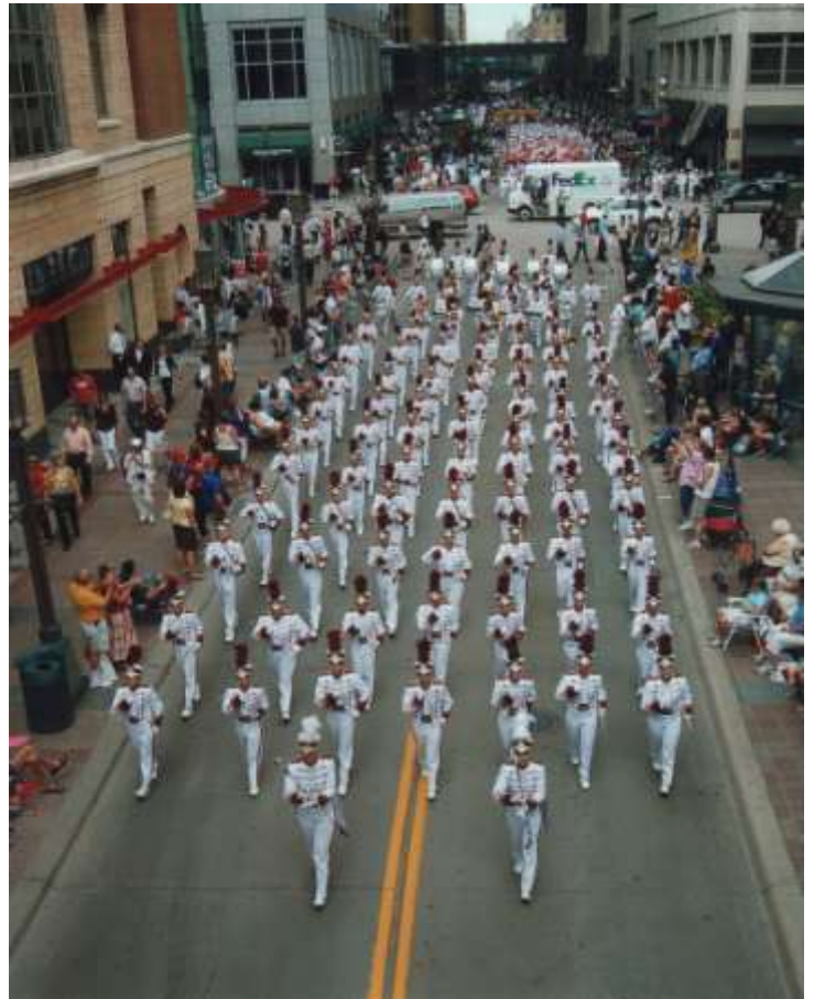
Fergus Falls Marching Band at the International Convention in MPLS on the Nicollet Mall in 2009

The Fergus Falls High School band program has a long tradition of excellence on the local, state and national levels. Recently the Fergus Falls High School Marching Band was honored with an appearance in the historic 2009 Presidential Inaugural Parade as the sole representatives of Minnesota. In the fall of 2009 the band became the first ever high school band to perform in the University of Minnesota Homecoming Parade. Other honors have included three appearances in the International Lions Parade, with a 1st place finish at Boston in 2006 and 2nd place in Minneapolis in 2009. The band also received 2nd place finish in the National Cherry Blossom Parade in Washington D.C. The band members, Fergus Falls High School, and the community of Fergus Falls all take pride in the Fergus Falls High School Marching Band. With each performance the band members hope that you too will "Share The Pride."