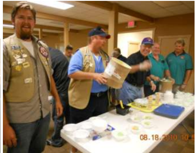
Monticello Lions serving ice cream at the Camp Friendship Ice Cream Social.